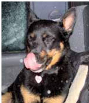
mmmmm mouth watering

Preheat oven to 180 degrees. Combine flour, cinnamon and nutmeg and cut in shortening. Beat egg with milk and pumpkin and combine with flour, mixing well. Stir until soft dough forms. Drop by tablespoons onto ungreased cookie sheet and bake for 12 to 15 minutes. Let cool and serve.