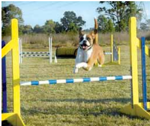
Eisha without her cape

doesn't run off when off lead, is friendly to other dogs and people and has no joint problems come along and see if you like it.