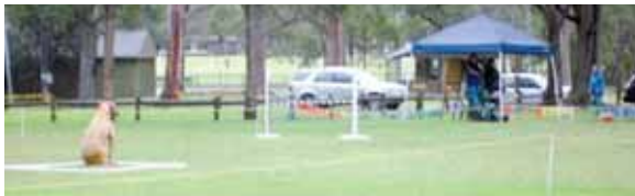
Where'd everybody go?

With plenty of consistency and patience, your dog should be a pleasure for the entire family to enjoy.